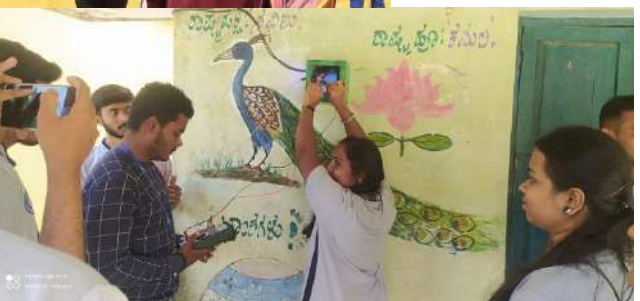
Student's field visit to perform AICTE point activity